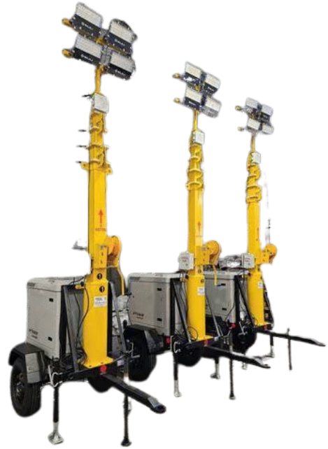
WALK BEHIND ROLLER