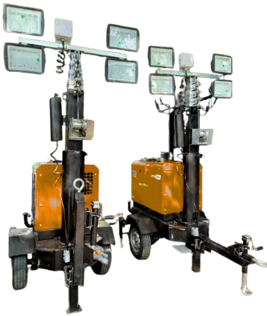
RIDE ON ROLLER